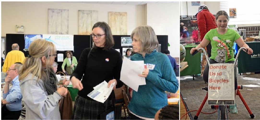
2018 Green Living Fair